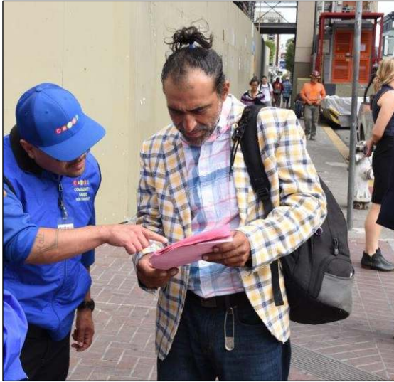
(wayfinding support for visitors)