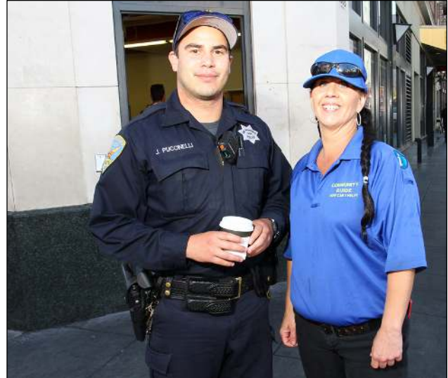
(Safety Team checking in with local business)